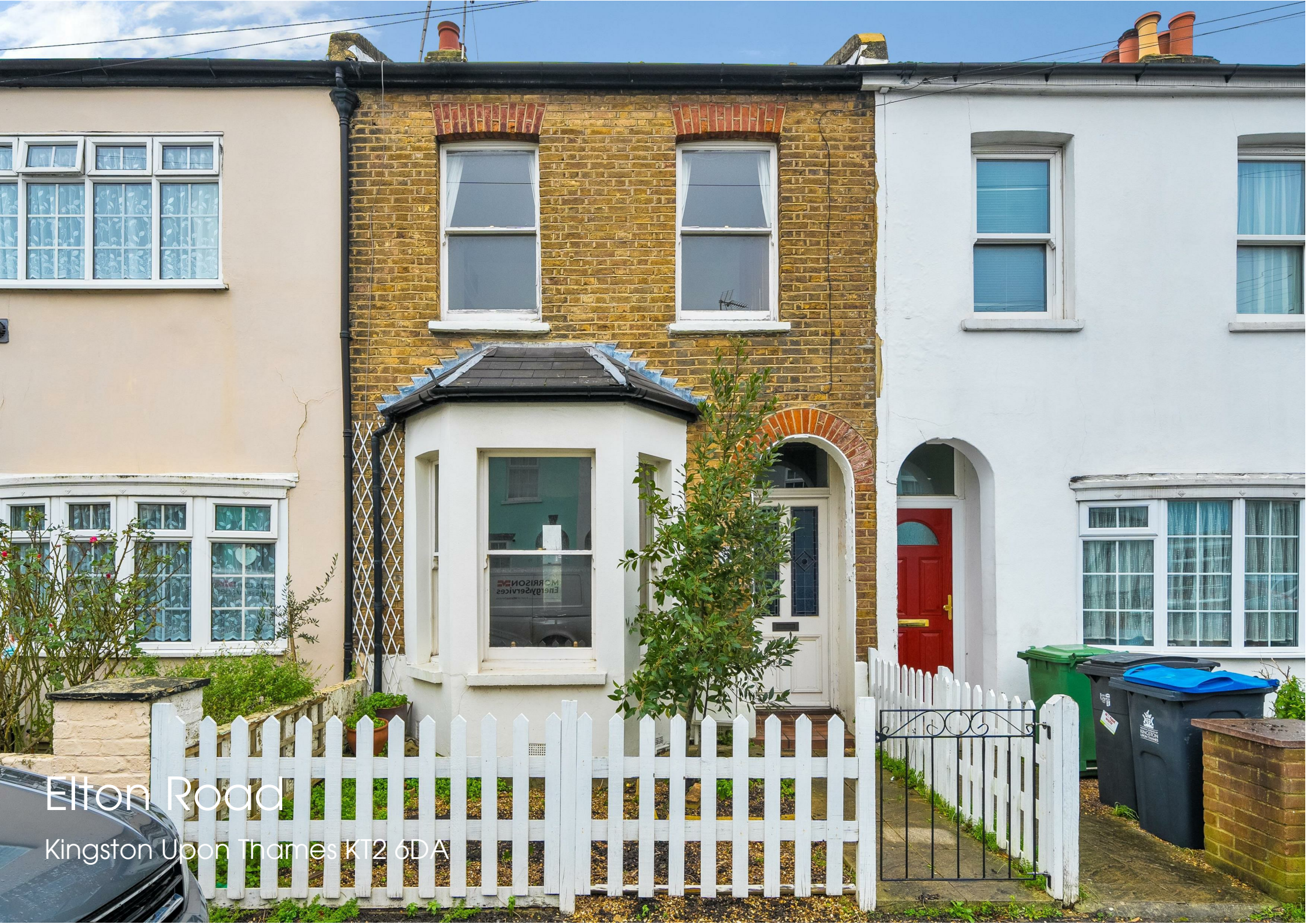
Elton Road Kingston Upon Thames KT2 6DA

Floor plan produced in accordance withRICS Property Measurement 2nd Edition, incorporating International Property Measurement Standards (IPMS Residential). © Redroom 2025. Produced for Gibson Lane, REF: 1224435